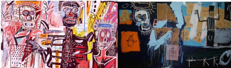
John Michel Basquiat